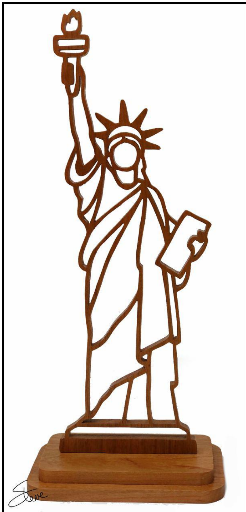
Statue of Liberty