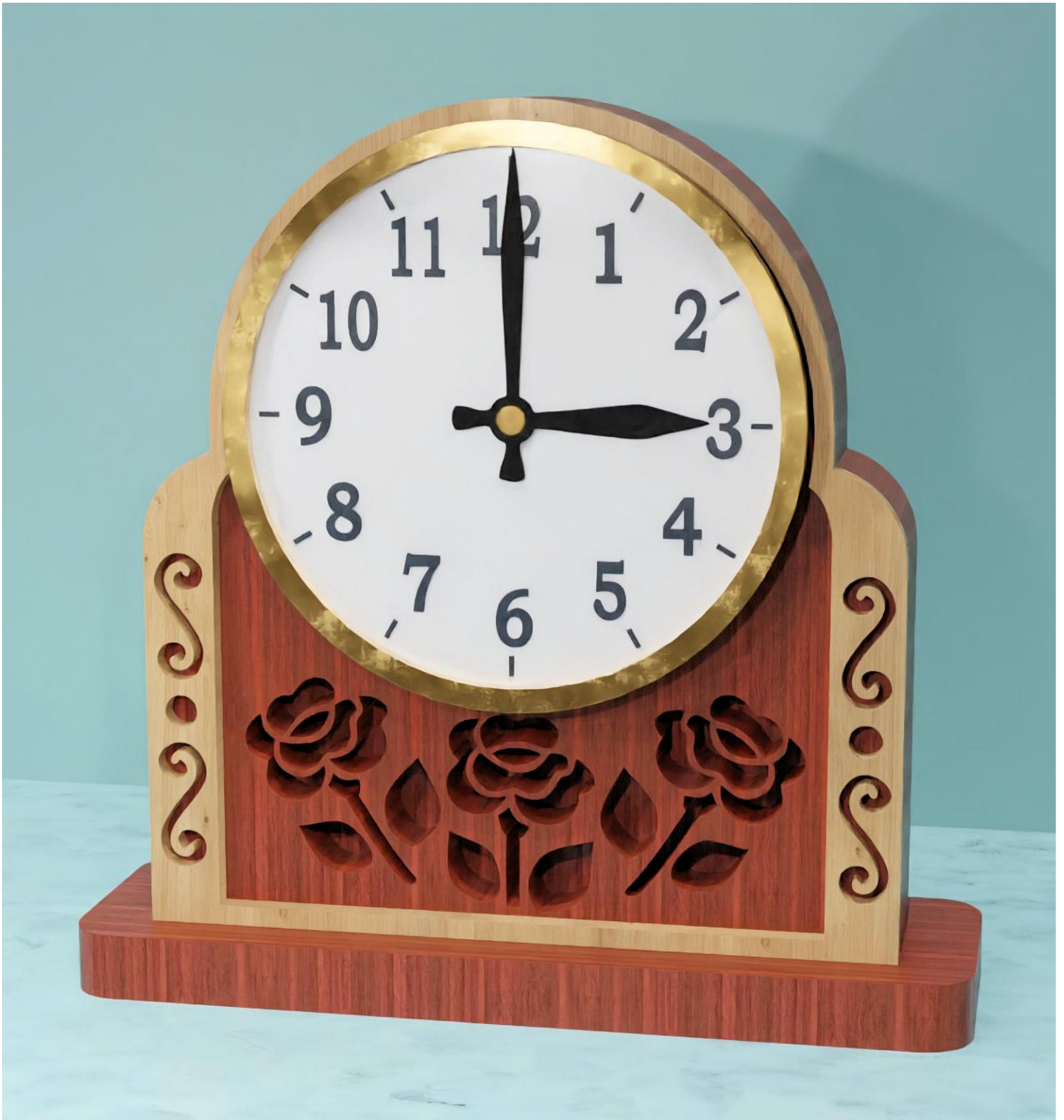
Six Inch Mantle Clock The clock stands 9.5" tall