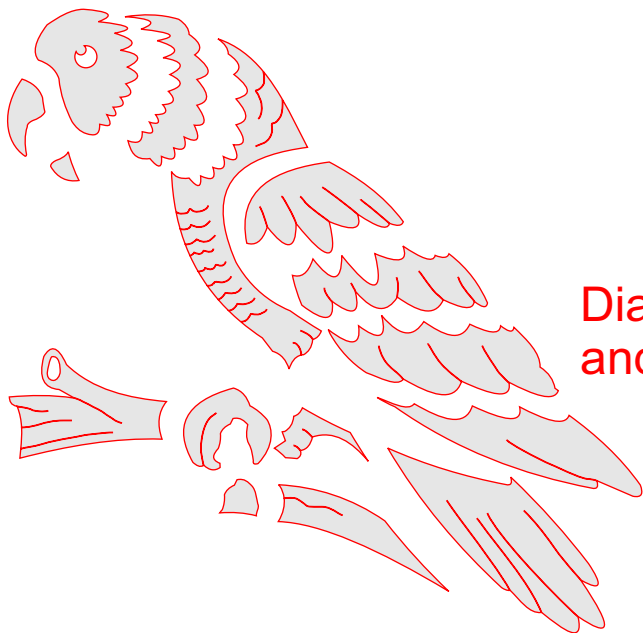
Diagram of pieces and veining.