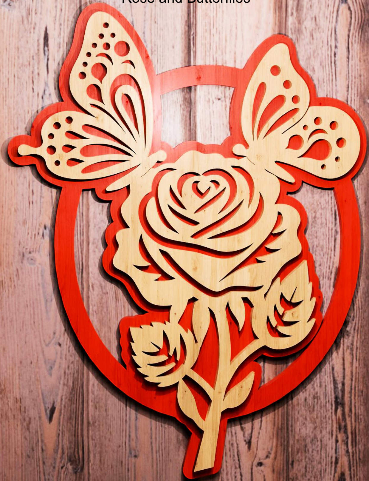
Rose and Butterflies