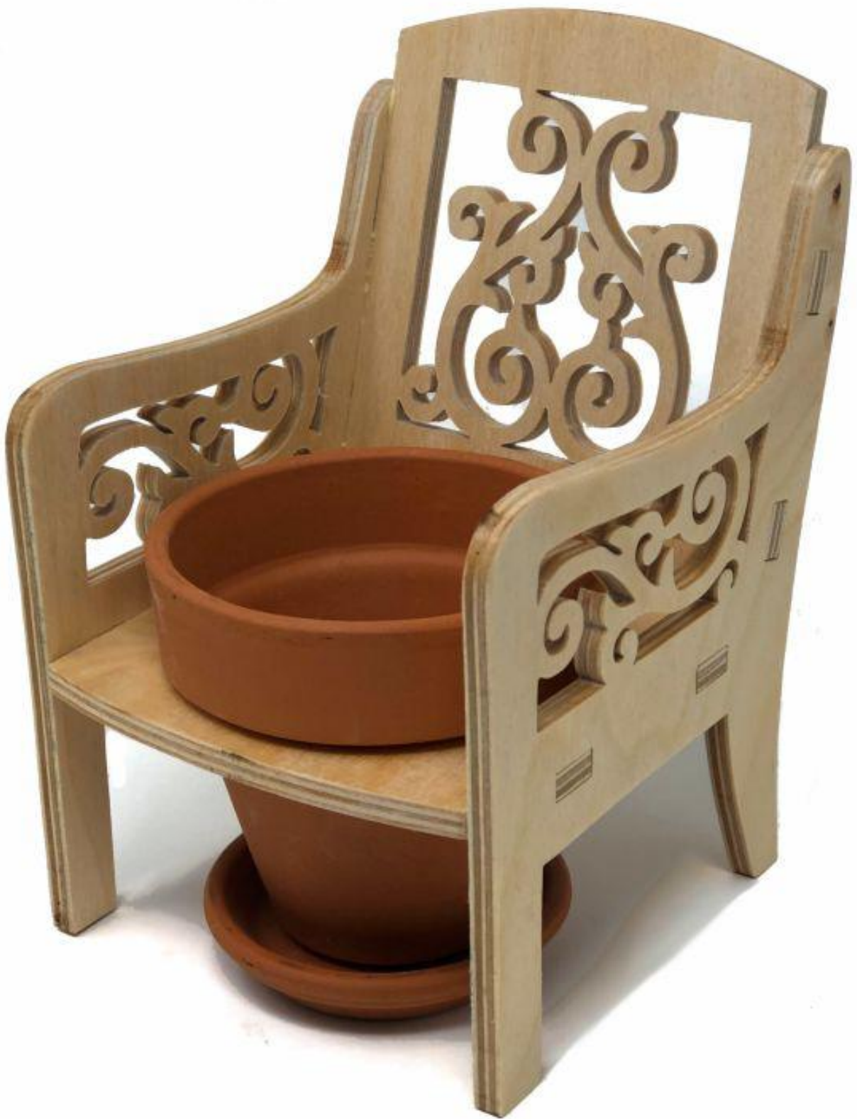
3 1/2" Terracotta Pot with Saucer