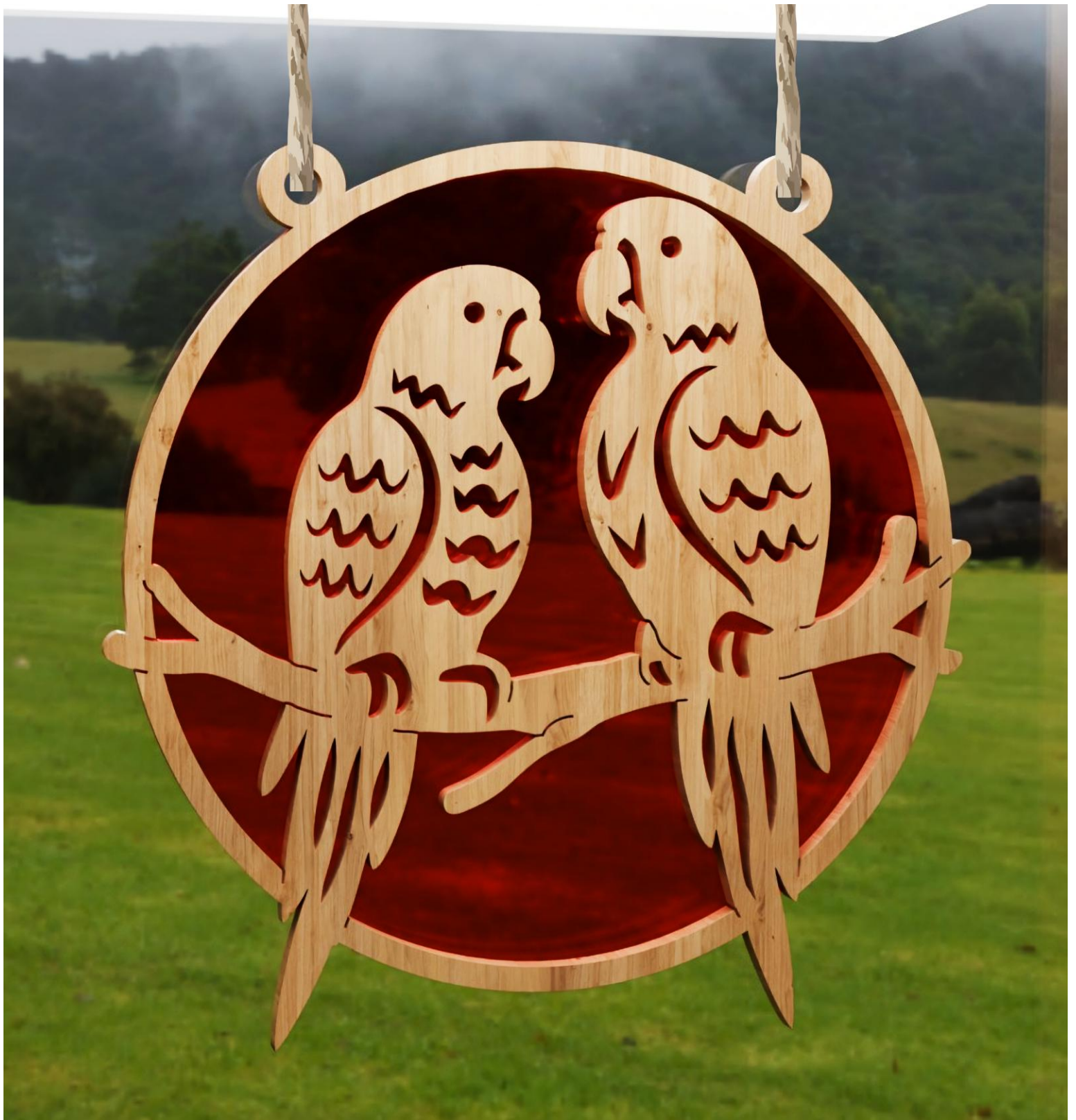
Parrotts with red plexiglass backer