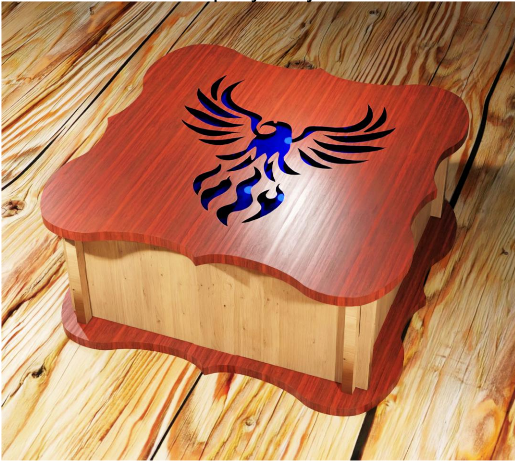
Men's Side Table Box with Optional Epoxy Inlay.