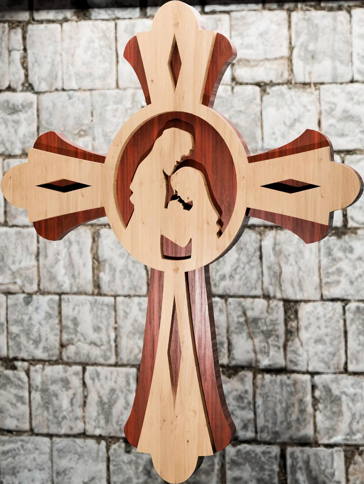
Jesus, Mary, and Joseph Cross