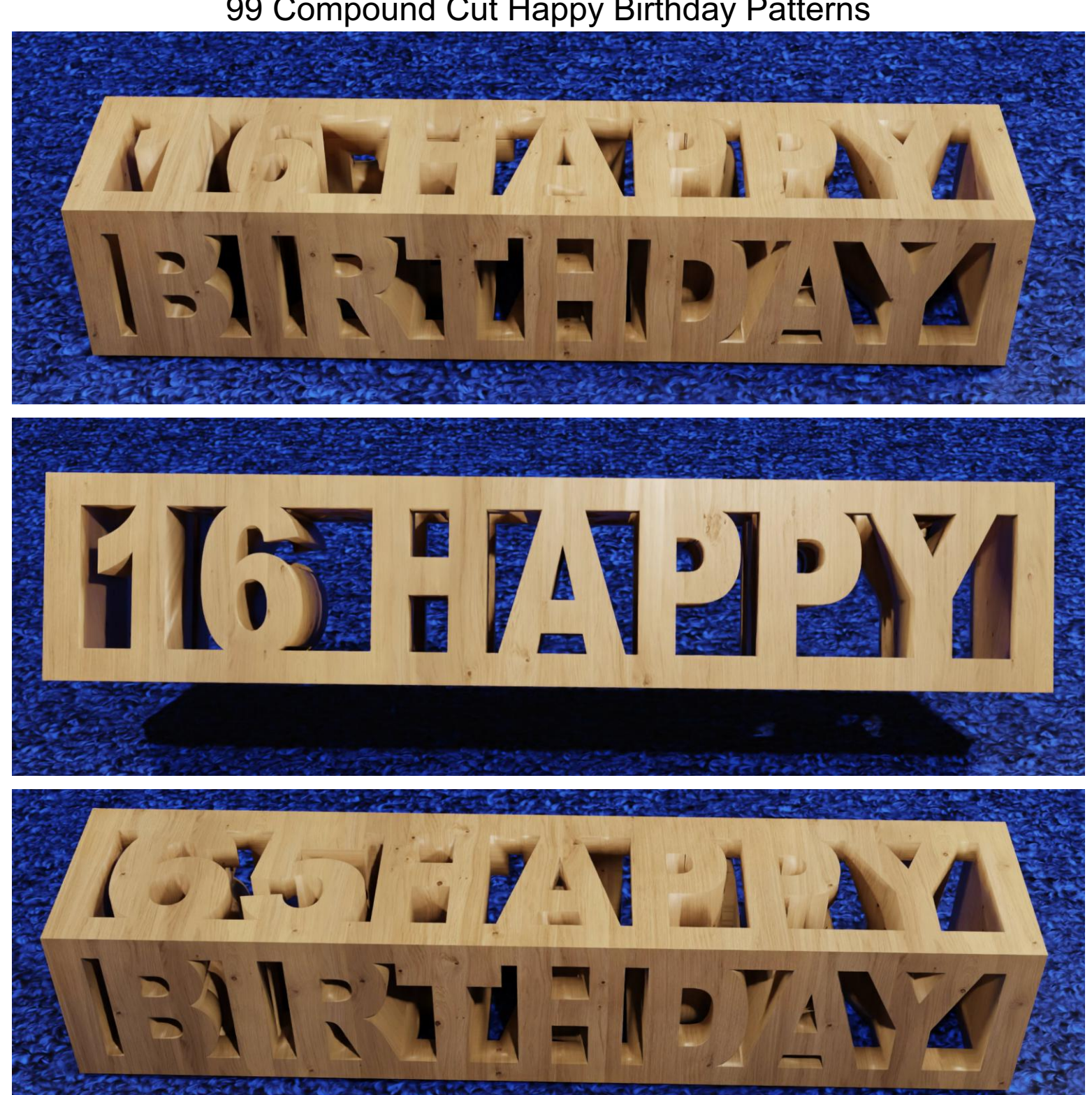
All blanks are cut to 7" X 1.5" X 1.5"