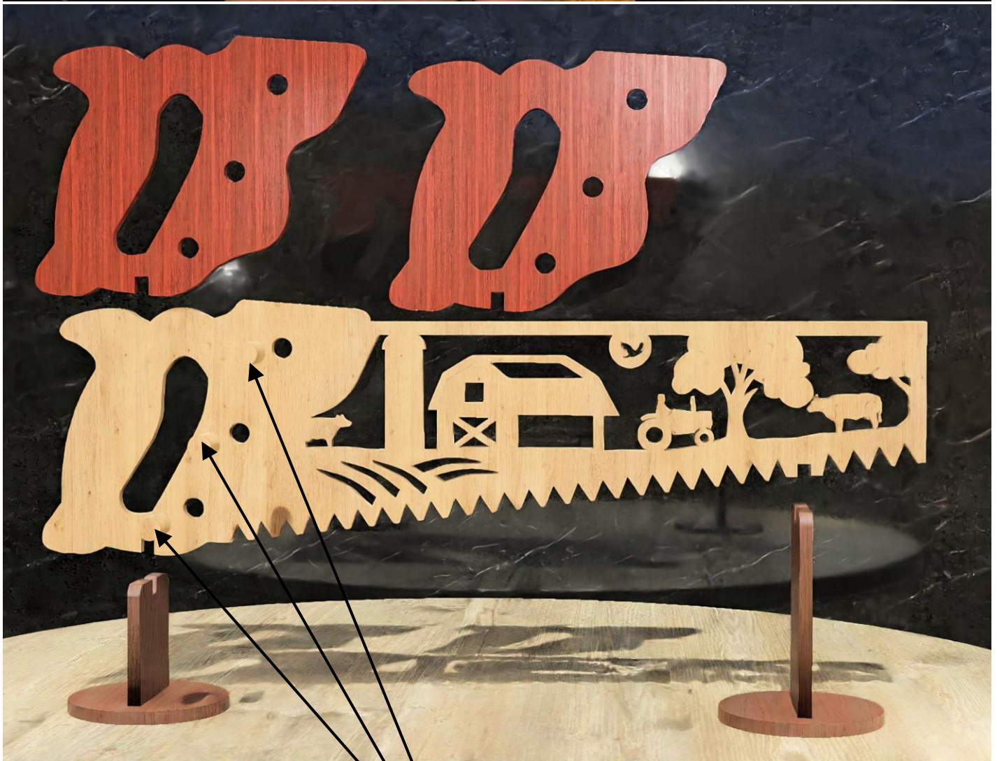
Use 1/4" wooden dowels