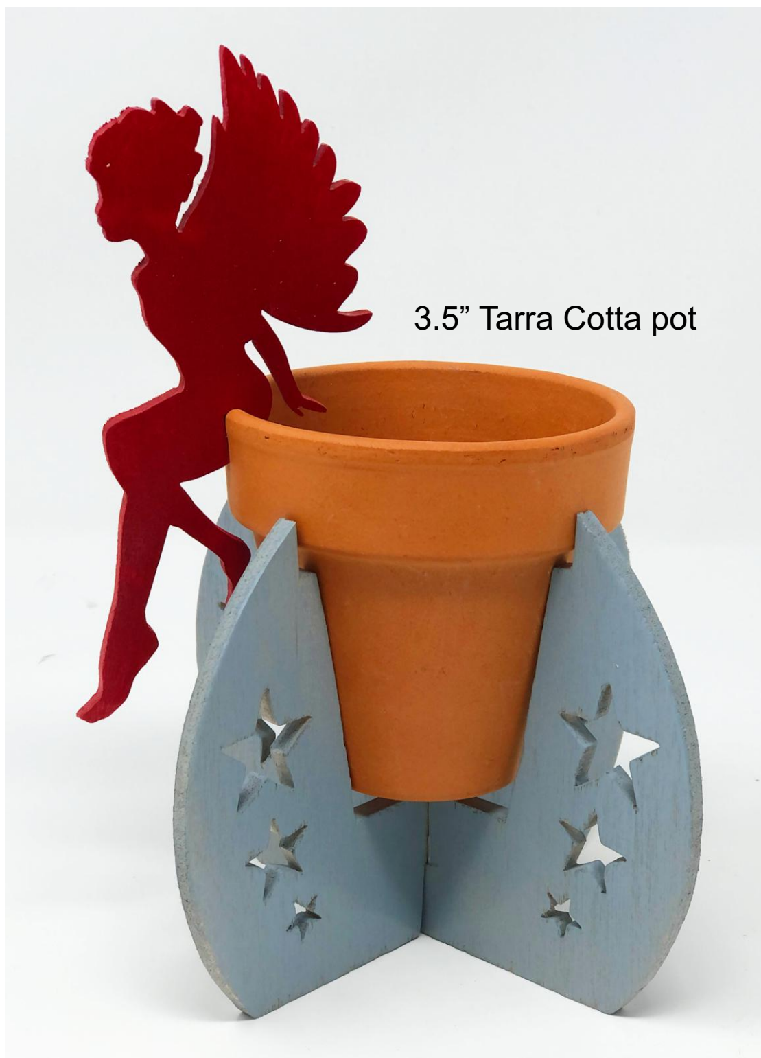
3.5" Terra Cotta pot