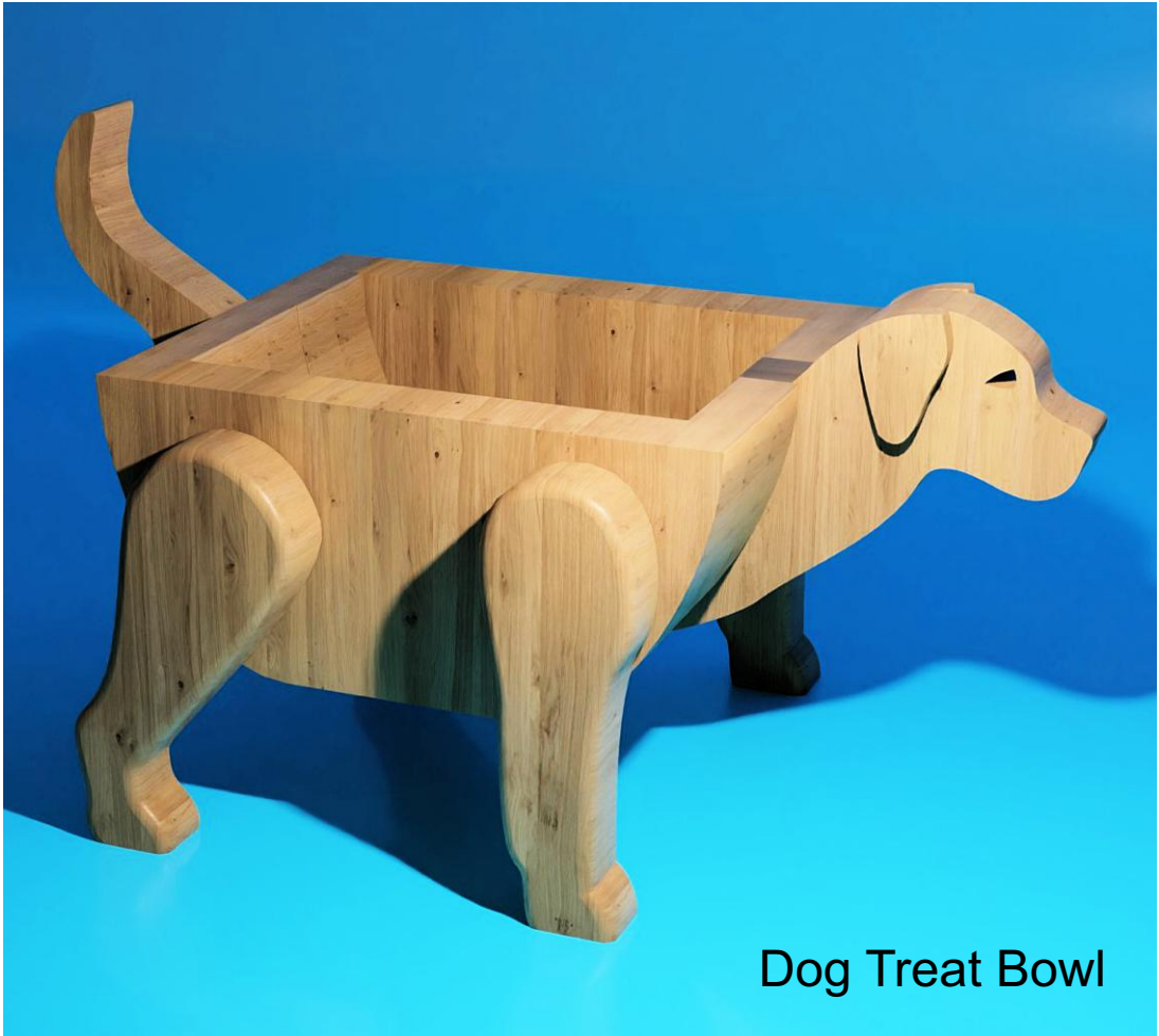
Dog Treat Bowl