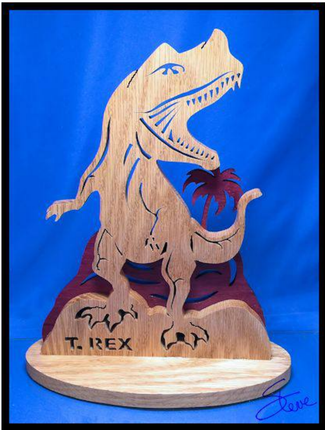
T. Rex Dinosaur