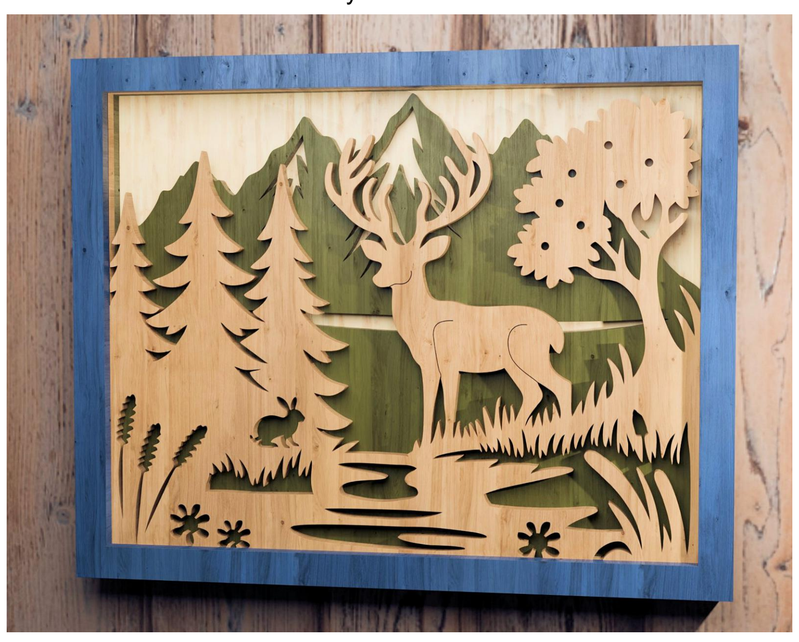
1/4" Thick Plywood