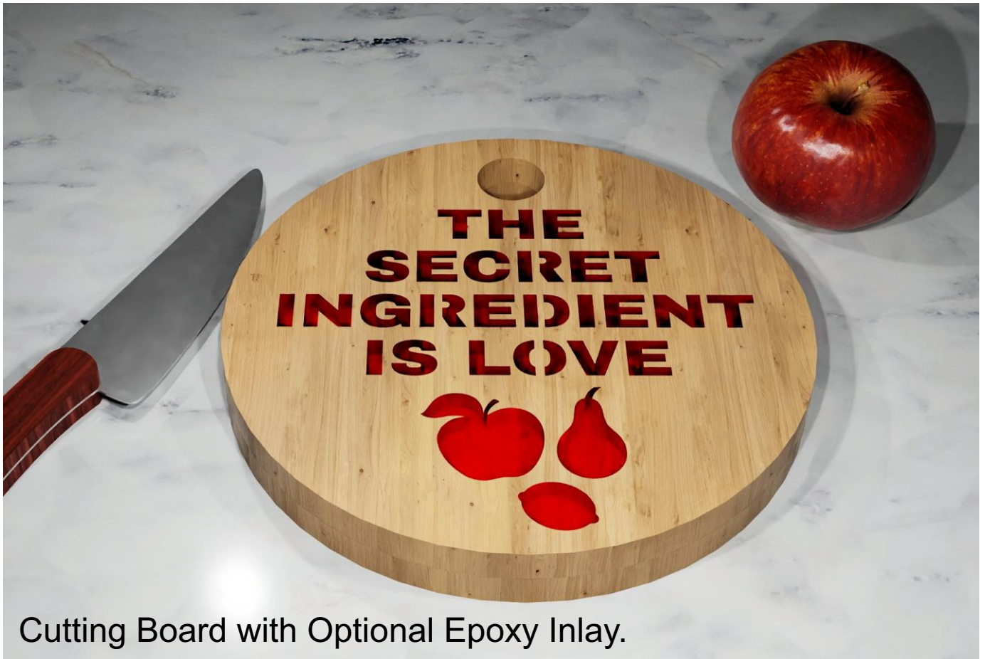
Cutting Board with Optional Epoxy Inlay.