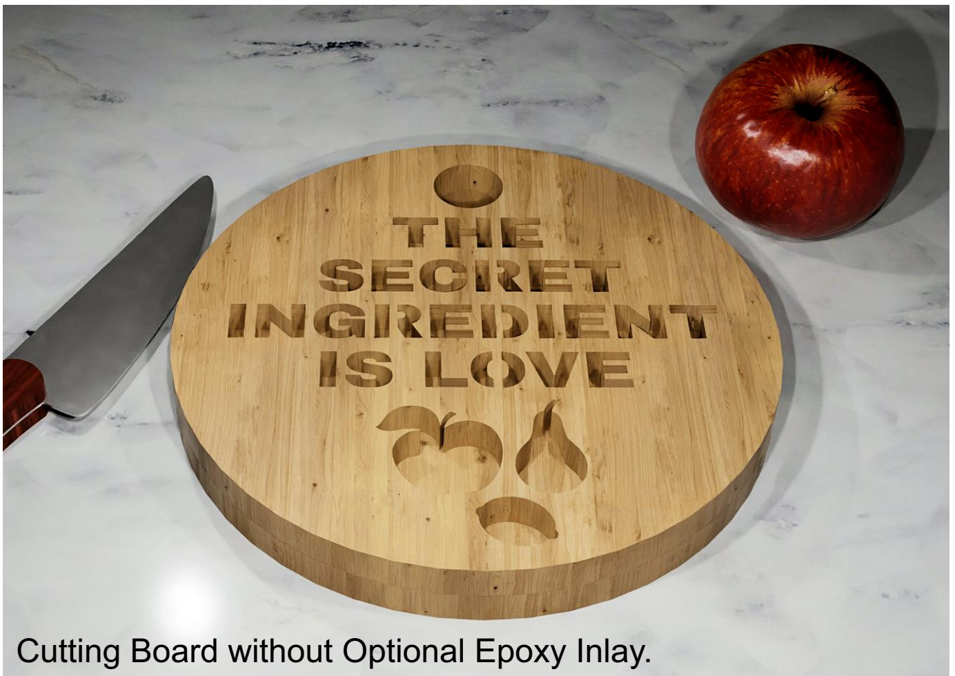
Cutting Board without Optional Epoxy Inlay.