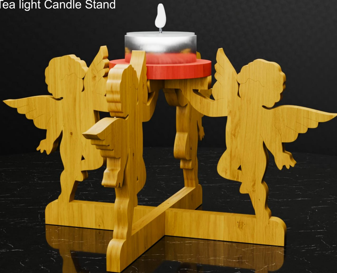
Tea light Candle Stand