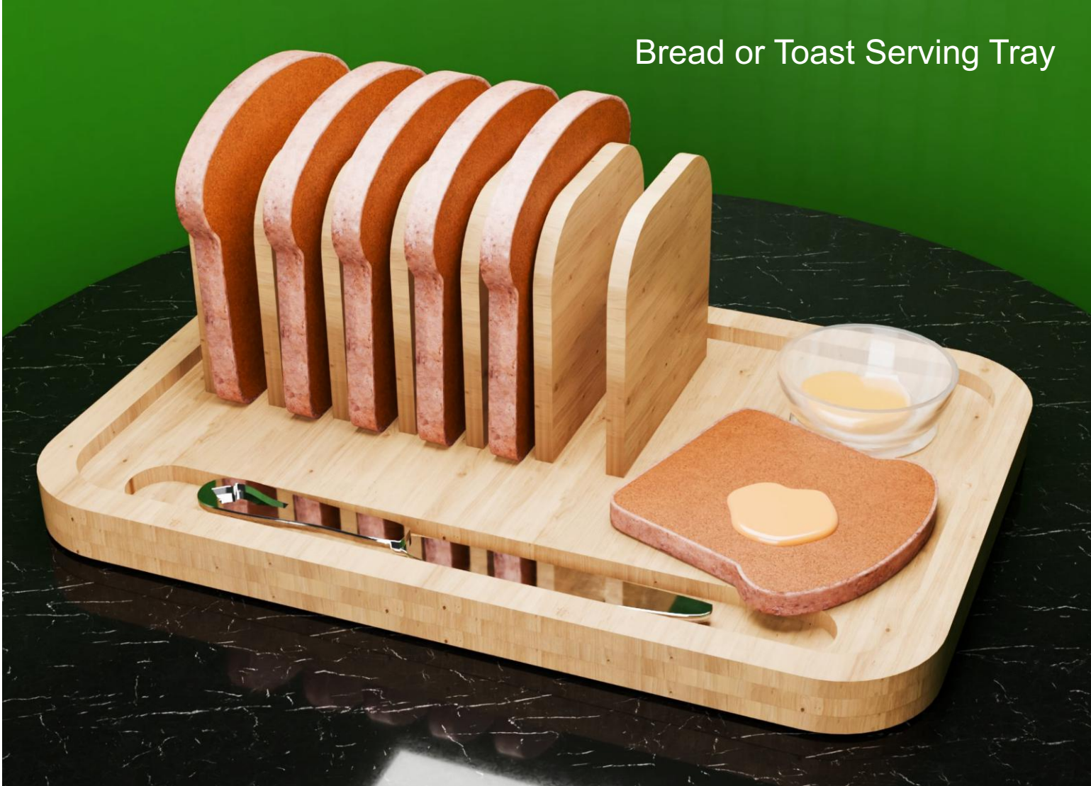
Bread or Toast Serving Tray