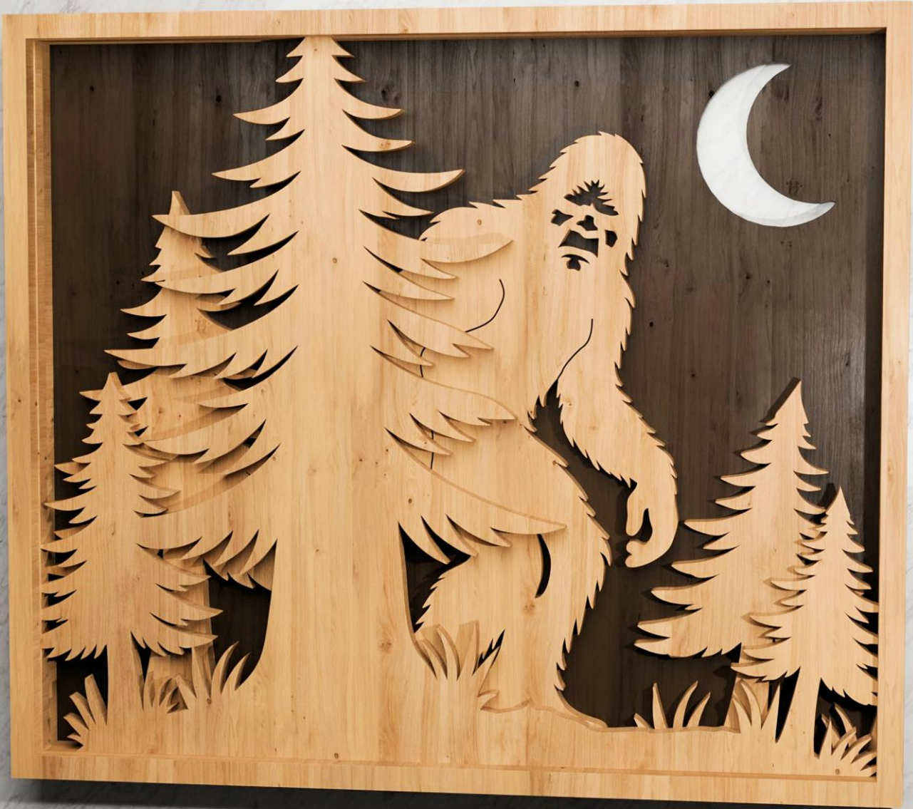
Hiding Big Foot