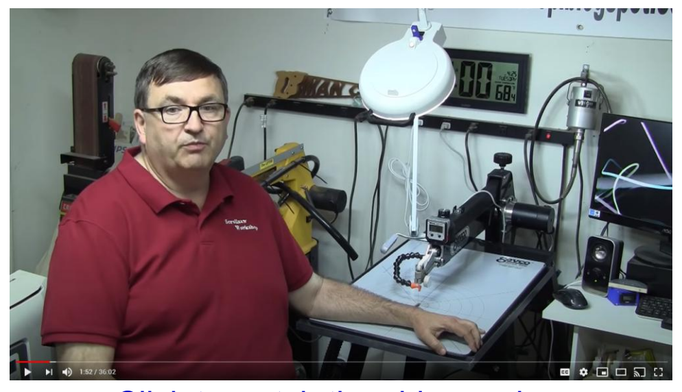
Click to watch the video review