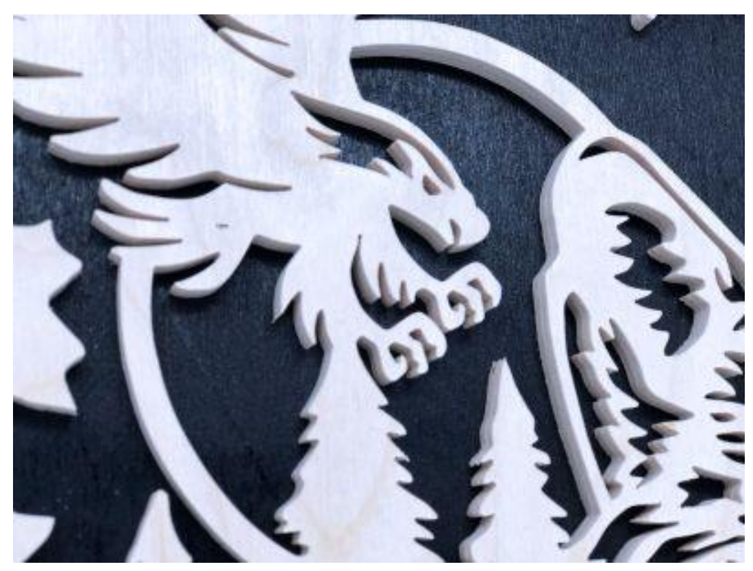
I used 1/4" Baltic birch plywood for both the cutting and the backer board. I painted the backer board black. The pattern prints on two pages. The blue tape in the middle just holds the pattern together while I glue it down.