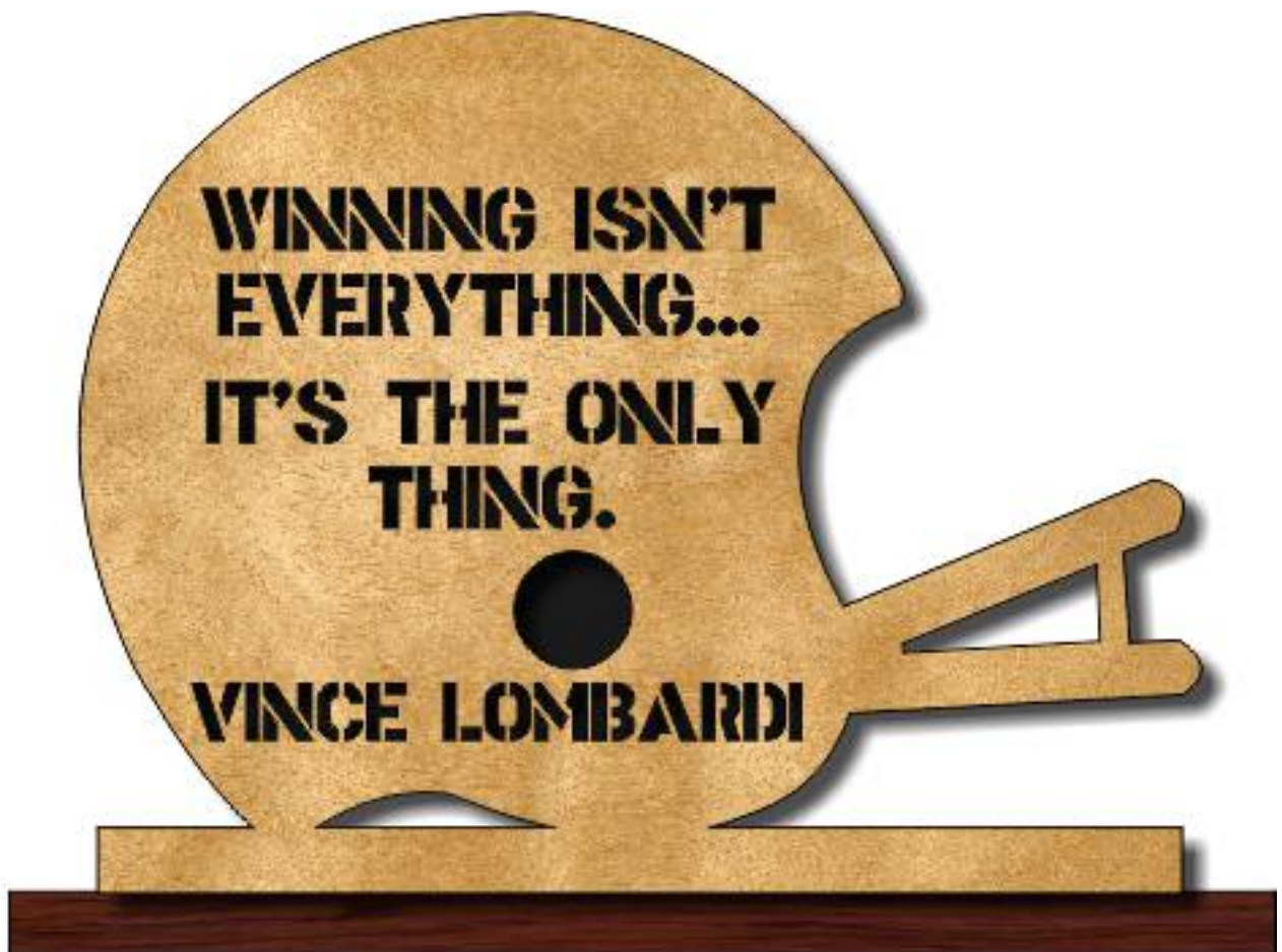
Vince Lombardi Helmet