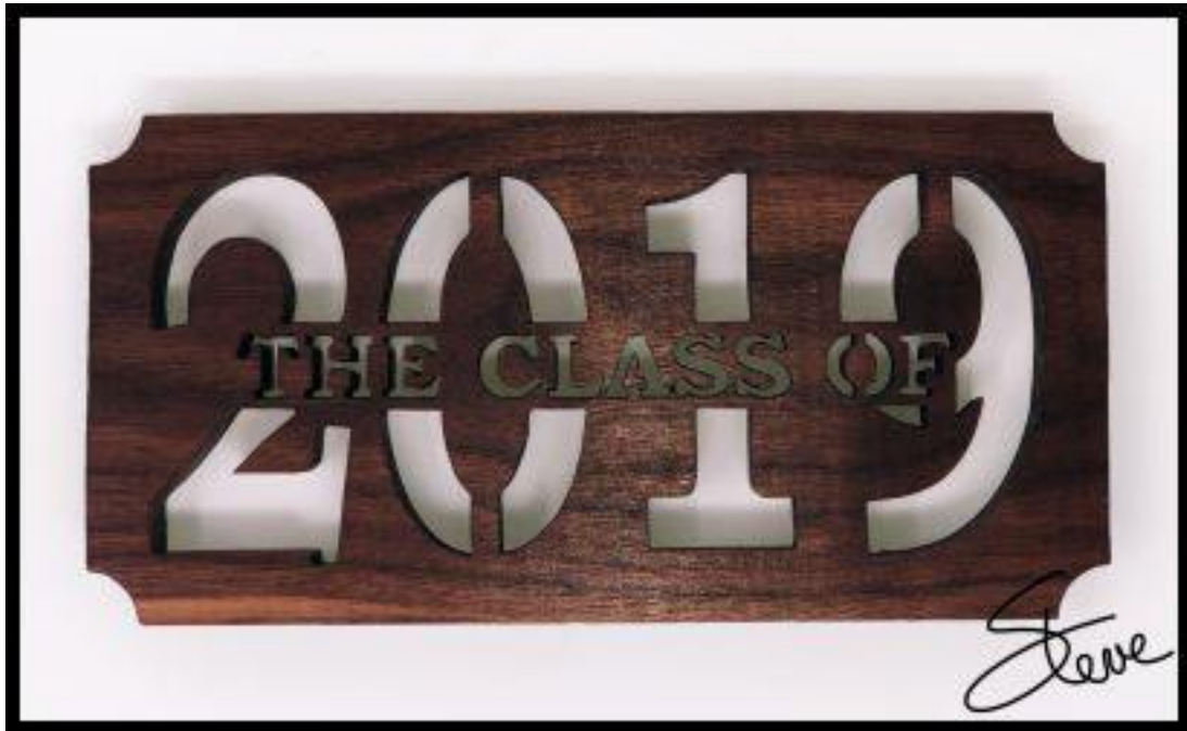
The Class of 2019

Add your graduates name to customize the pattern.