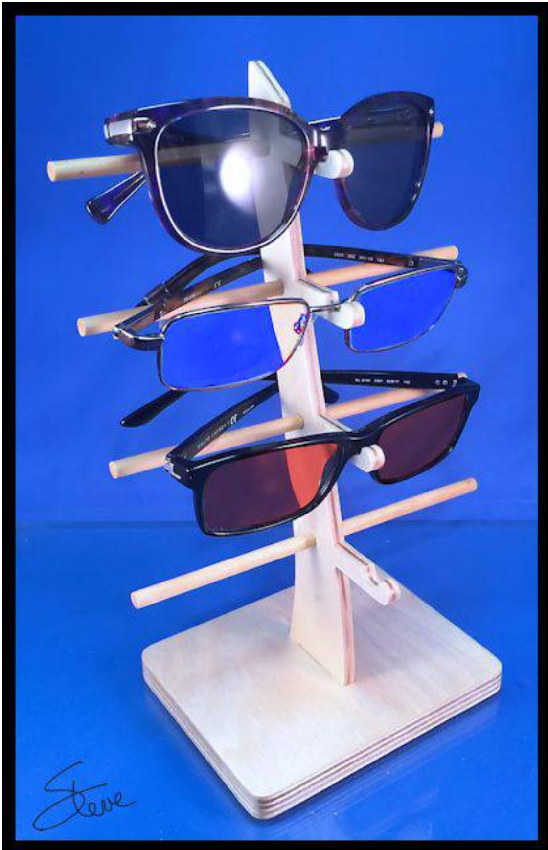
Sunglass Stand. Holds four pairs.