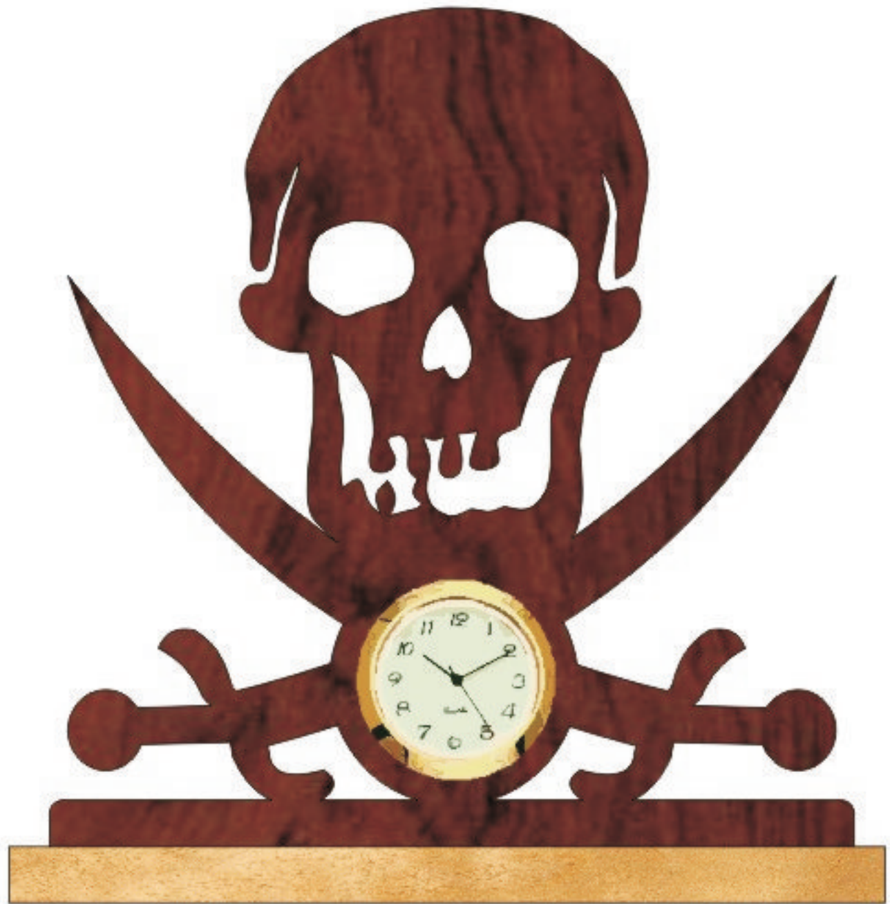
Skull mini clock.