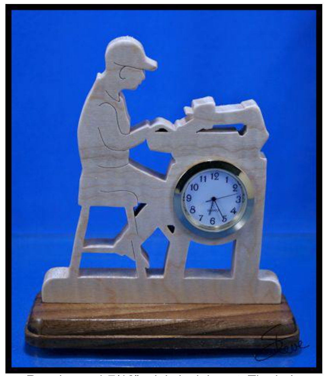
Requires a 1 7/16" mini clock insert. The hole for the clock can but drilled with a 1 3/8" fostner bit or use the scroll saw.