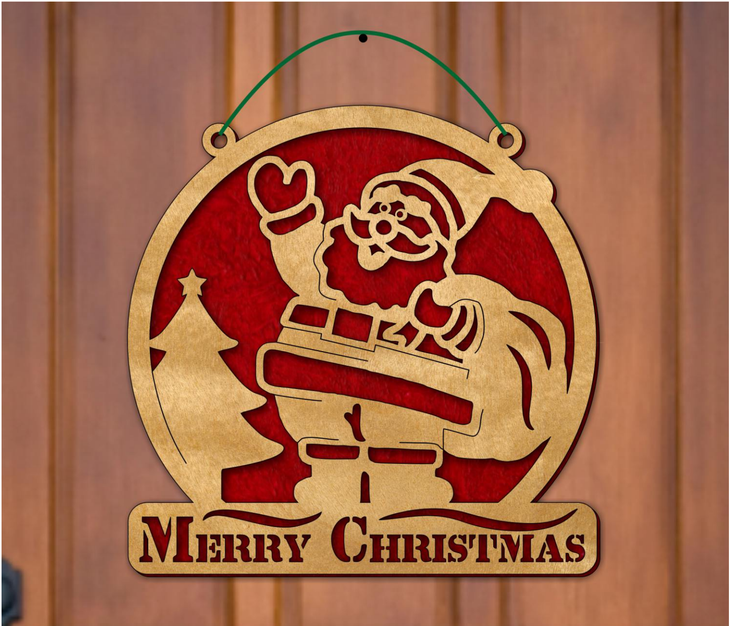
Large Santa Door Ornament