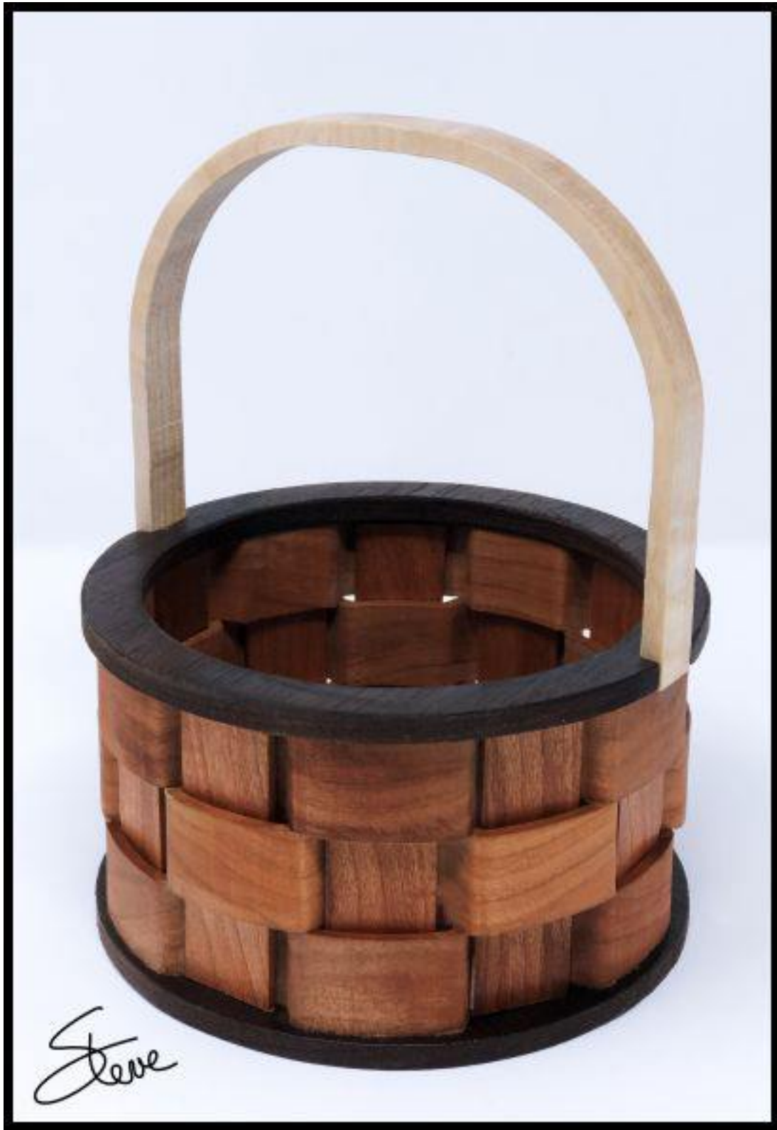
Round Woven Basket