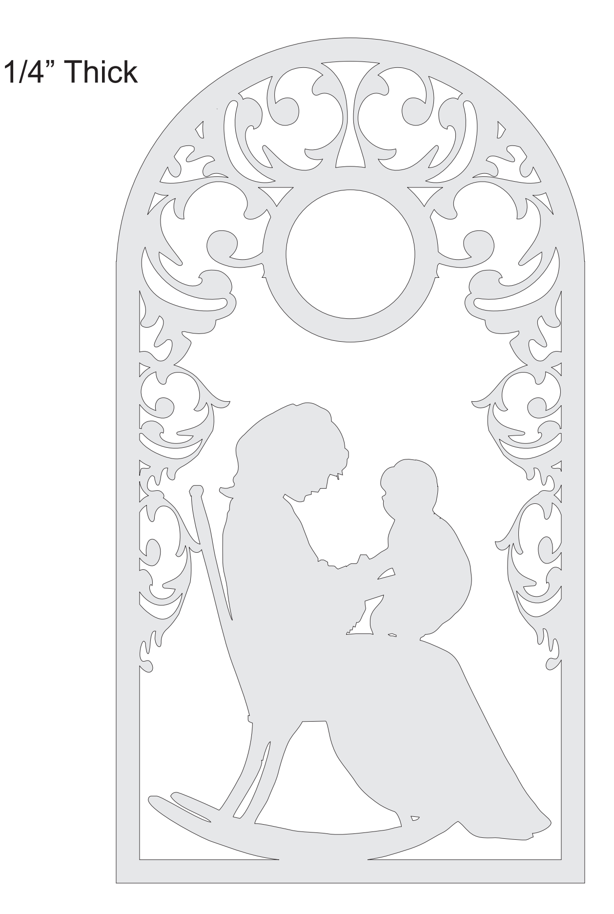
Use a 1 7/16" clock insert