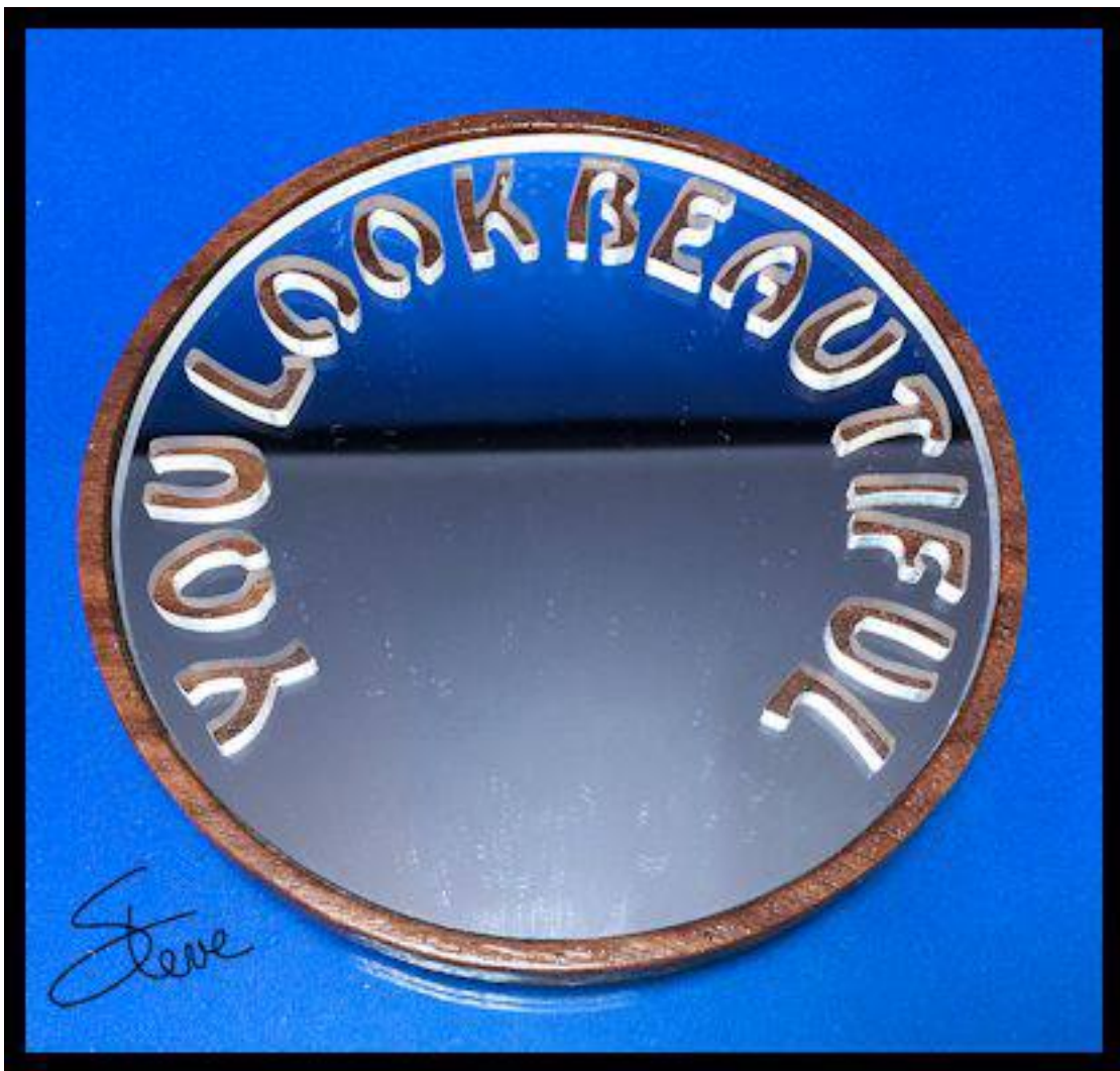
Four inch purse mirror