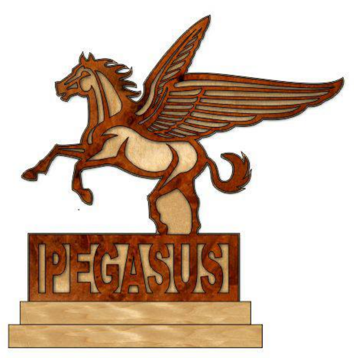
Original image by www.vectorportal.com adapted by Steve Good