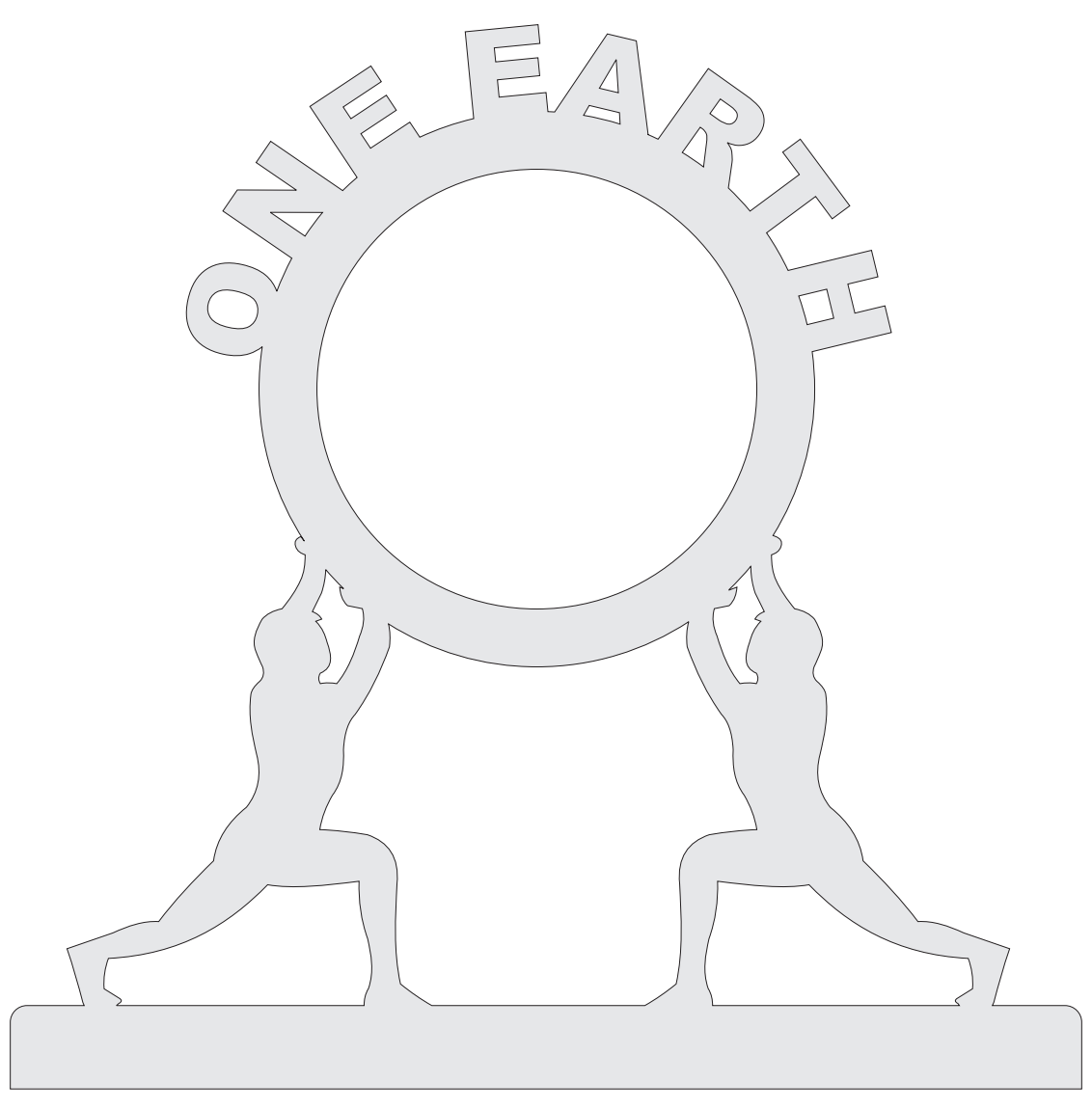
Requires a 2 3/4" clock insert. The hose is 2 3/8"