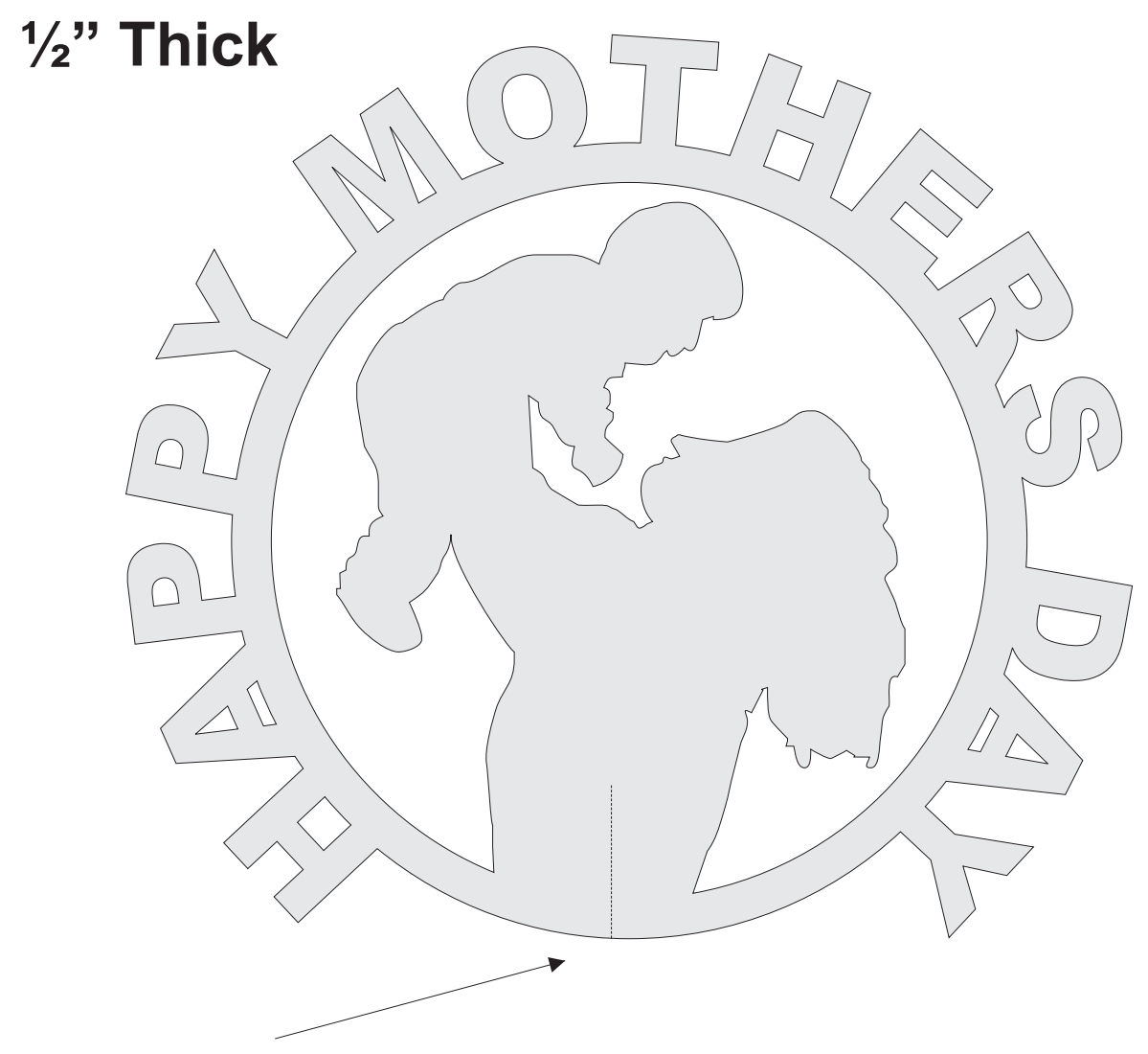
Drill 1/4" hole for dowel rod