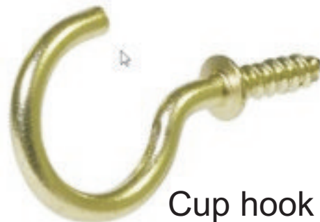
Cup hook for keys