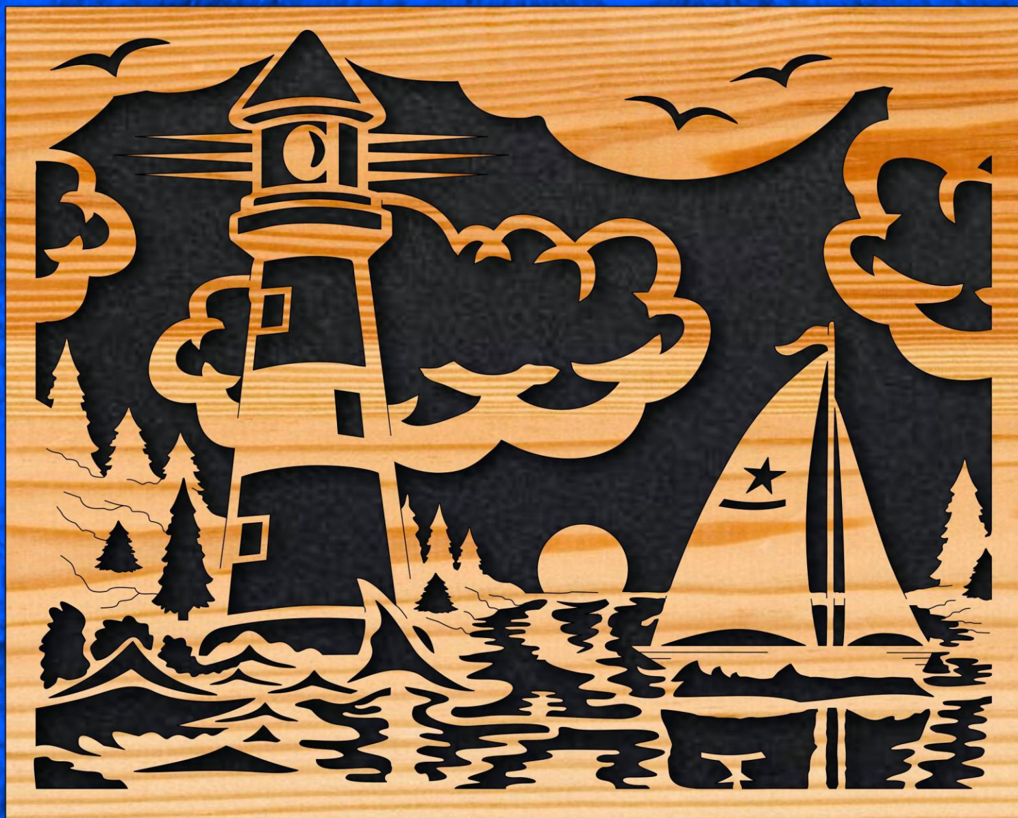
Lighthouse and Boat