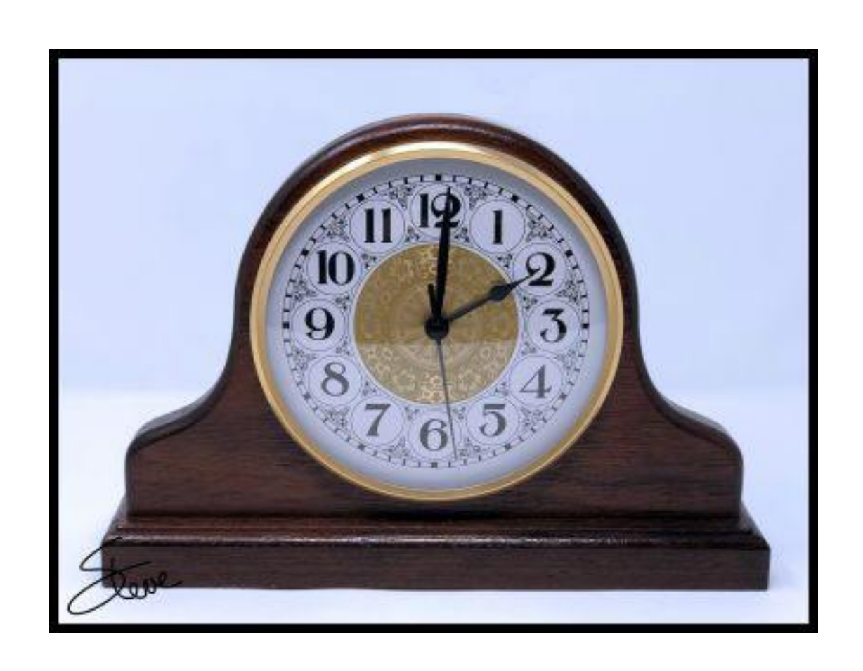
I buy my clock inserts at <a href="www.bearwood.com">www.bearwood.com</a>