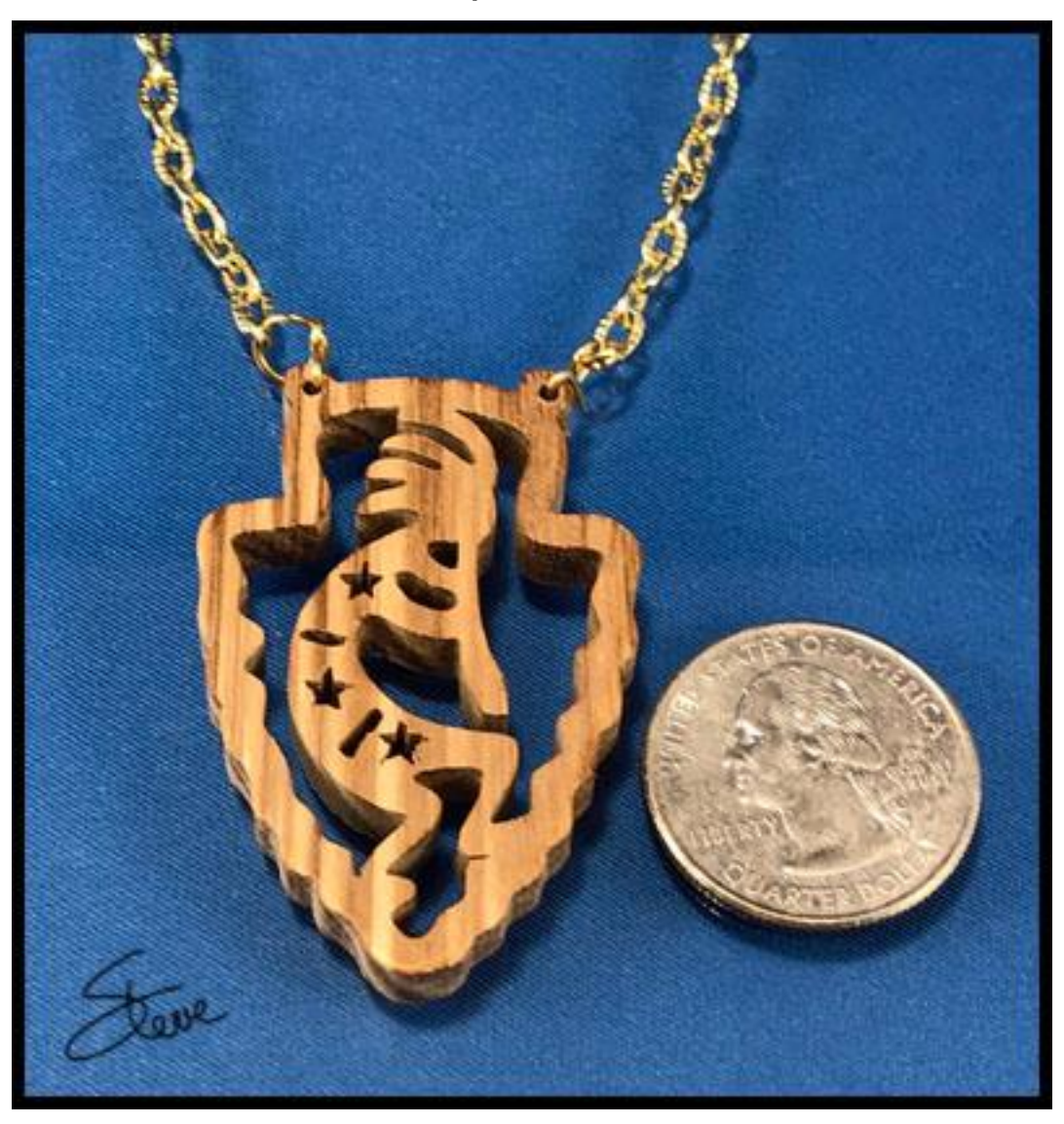
This pattern is small. I used a 2/0 blade and a #57 micro drill bit for the interior starter holes.