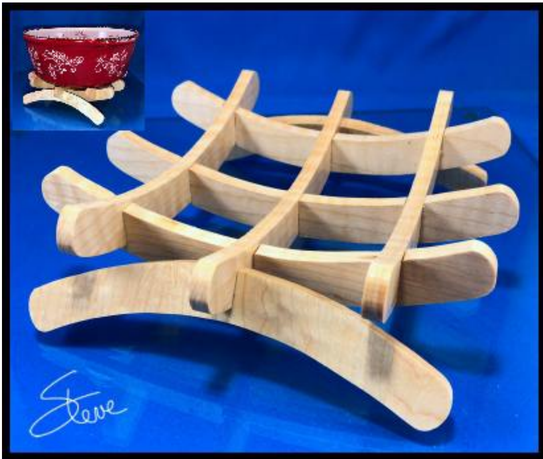
Hot Bowl Stand.