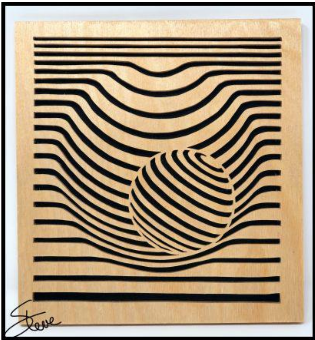
Gravity Warp Art