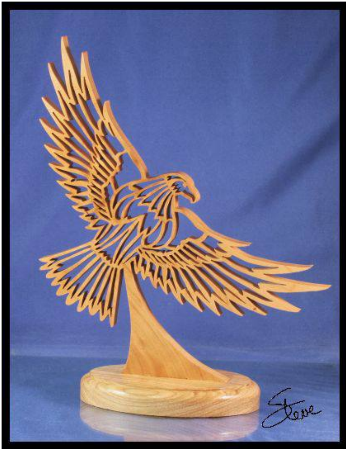
Flying Eagle Sculpture