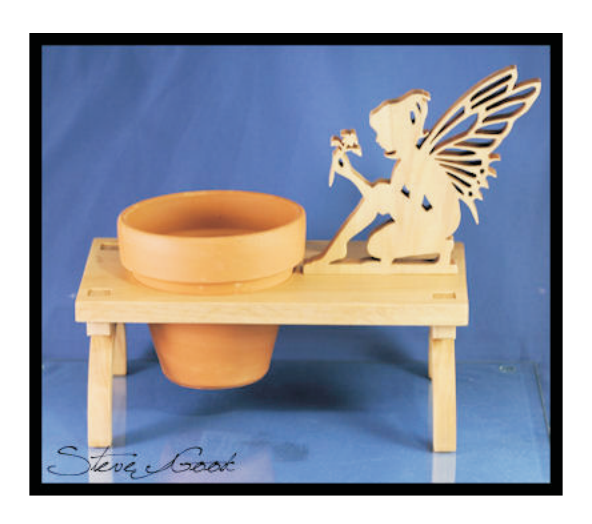
Requires a 4" clay flower pot.