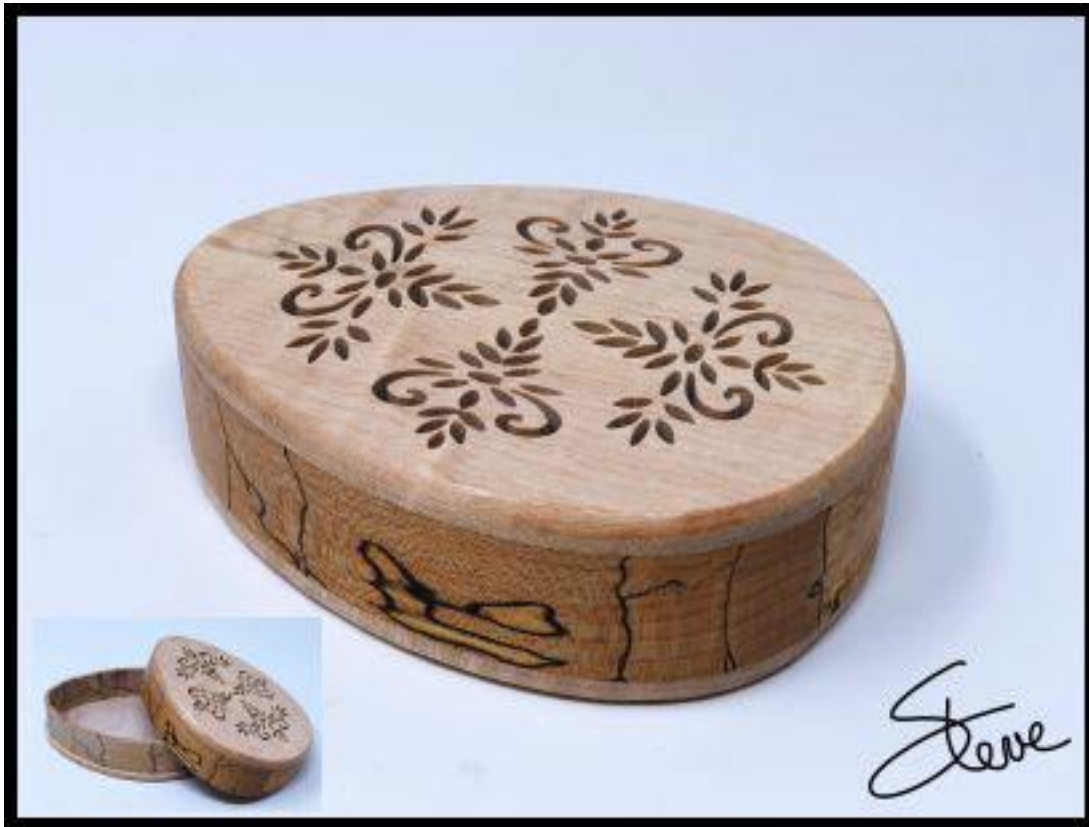
Easter Egg Box