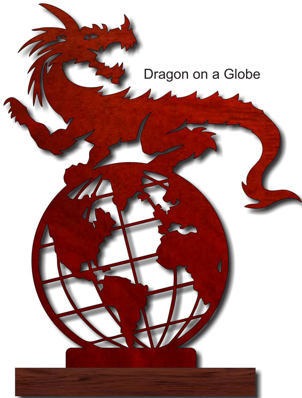
Dragon on a Globe