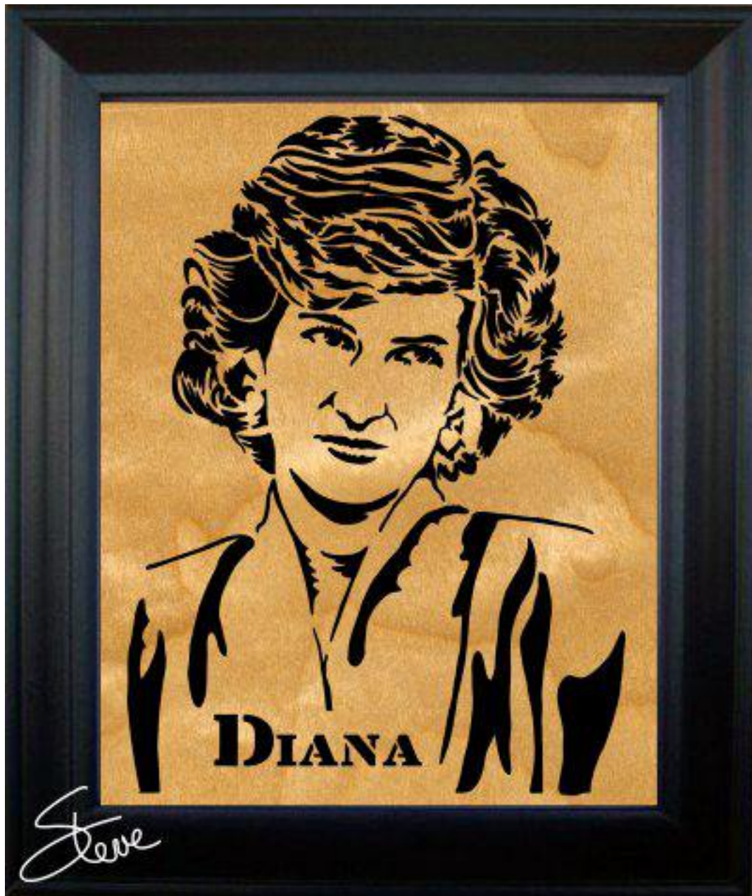
Diana, Princess of Wales