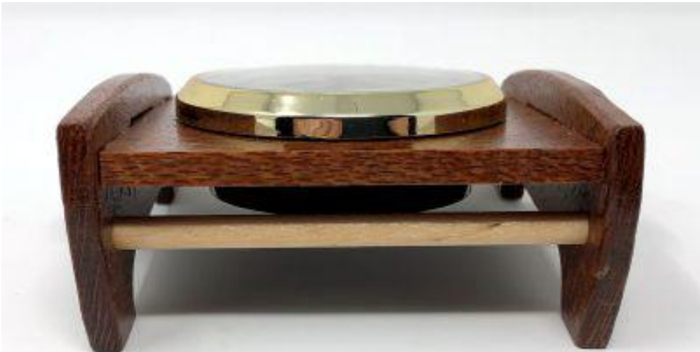
4" Long, 1/4" Diameter Wooden Dowel