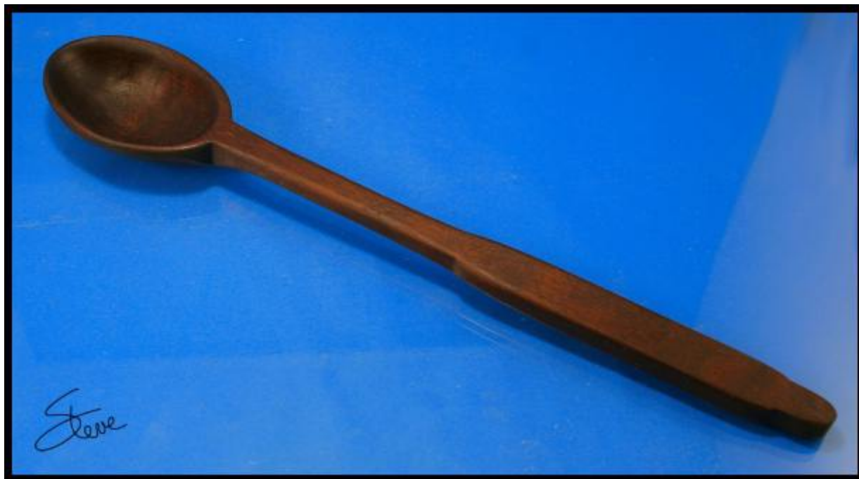
Wooden Spoon Pattern.