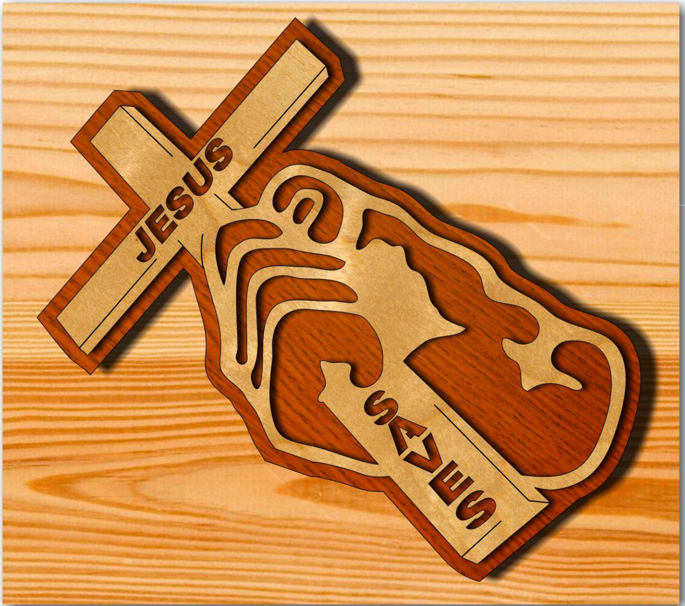
Hand Holding Cross