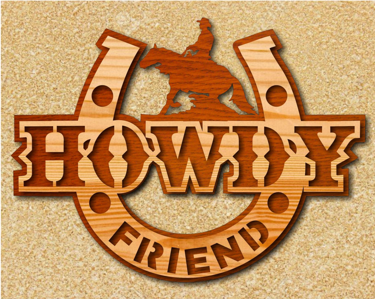
Cowboy Welcome Sign