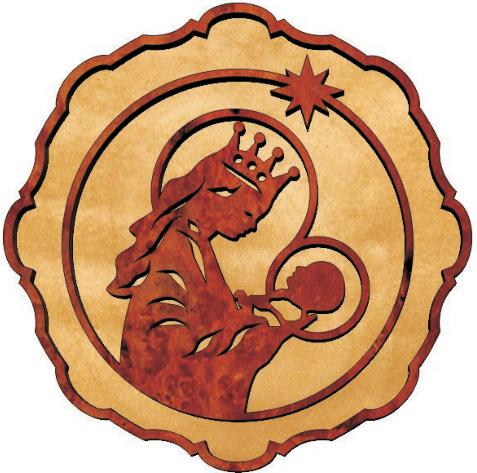
8 inch Christmas Plate.