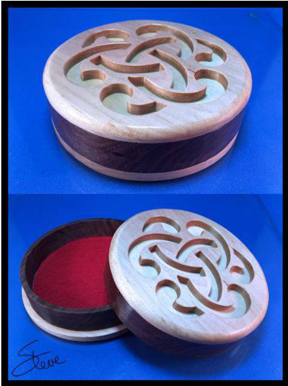
Celtic Knot Trinket Box.