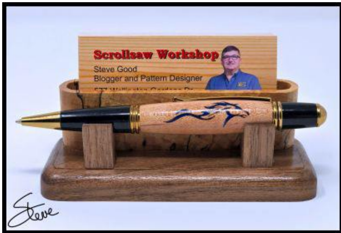
Business card and pen holder